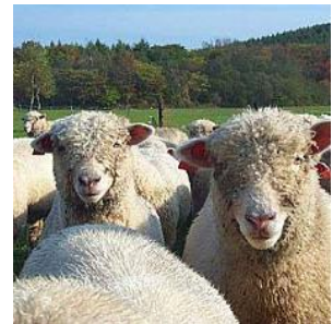
Day 6: Furano, Biei, Mt. Tokachidake & Sapporo

Drive to Furano Estimated driving time is approx. 2 hrs.