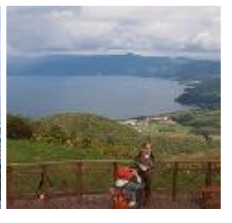
Day 3: Sobetsu, Shiraoi & Noboribetsu Onsen