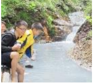
Day 4: Shimizu, Obihiro & Tokachigawa Onsen